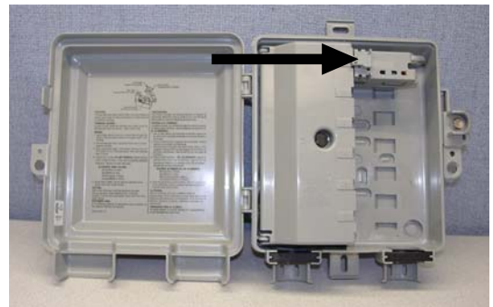
Figure 2: Release latch on modular jack.

Open the modular test jack cover (figure 2) by pressing the release tab while pulling up to reveal a jack like the ones found in your home. Plug your phone cable into the jack (figures 3 and 4). Now you have disconnected your inside wiring from the TNI and plugged your set directly into the telephone company network.