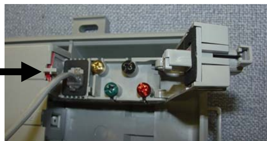
Figure 4: Plug telephone cord into the jack.